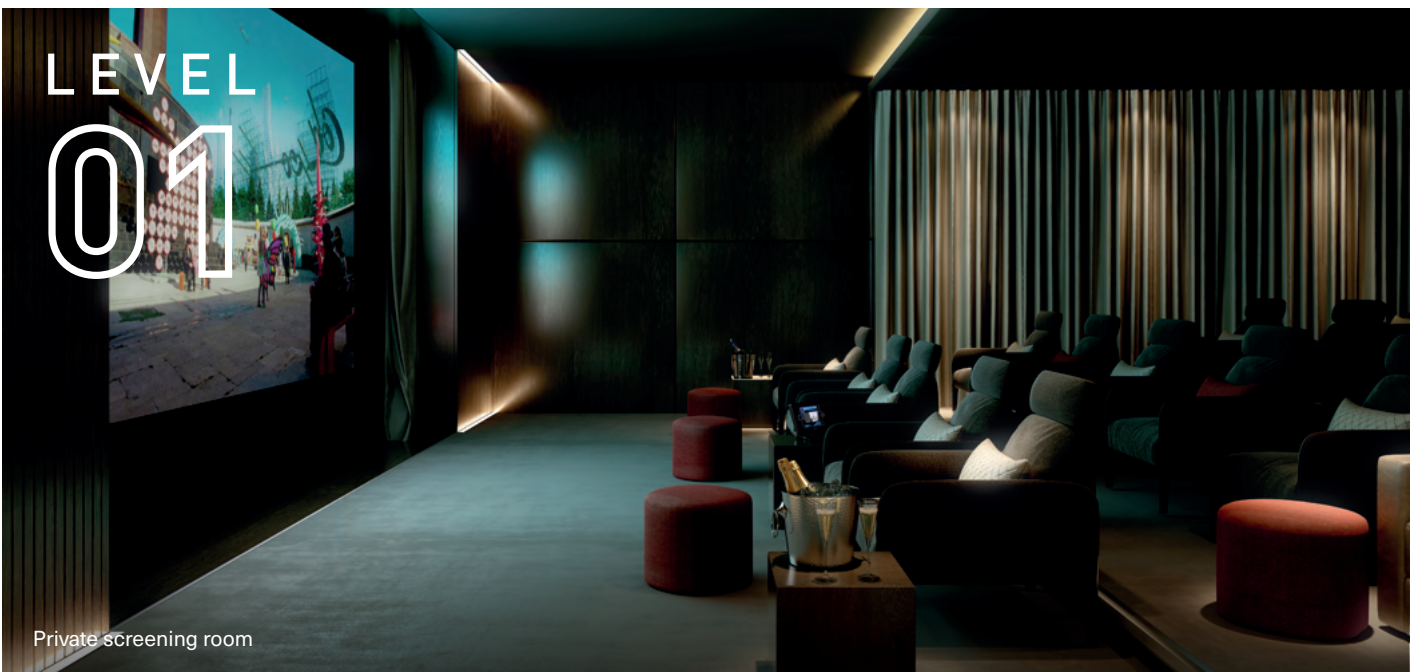
Private screening room