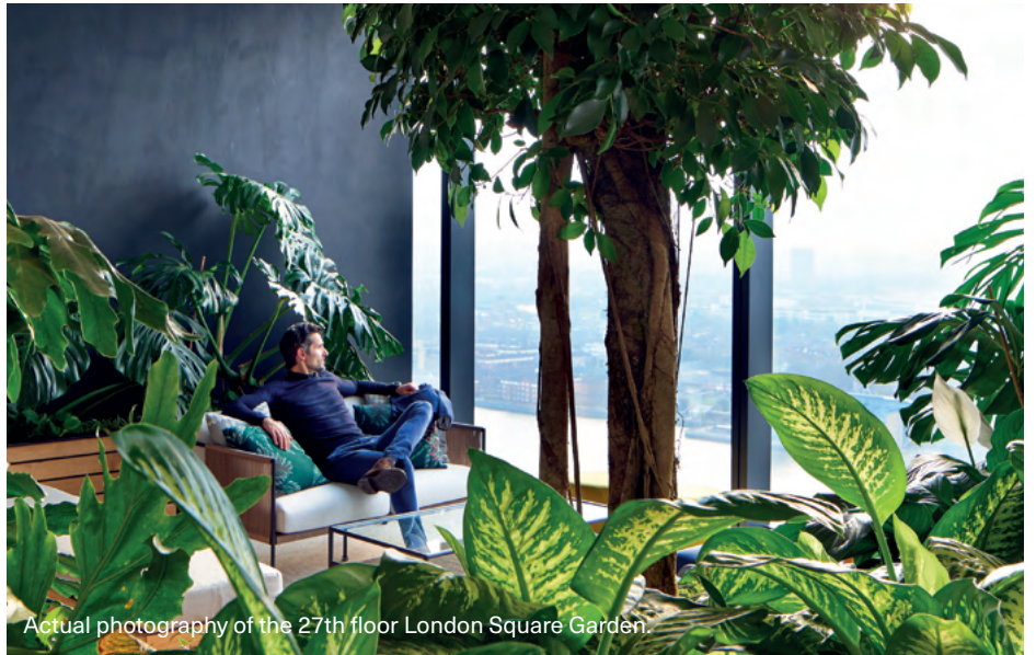
Actual photograph of the 27th floor London Square Garden.