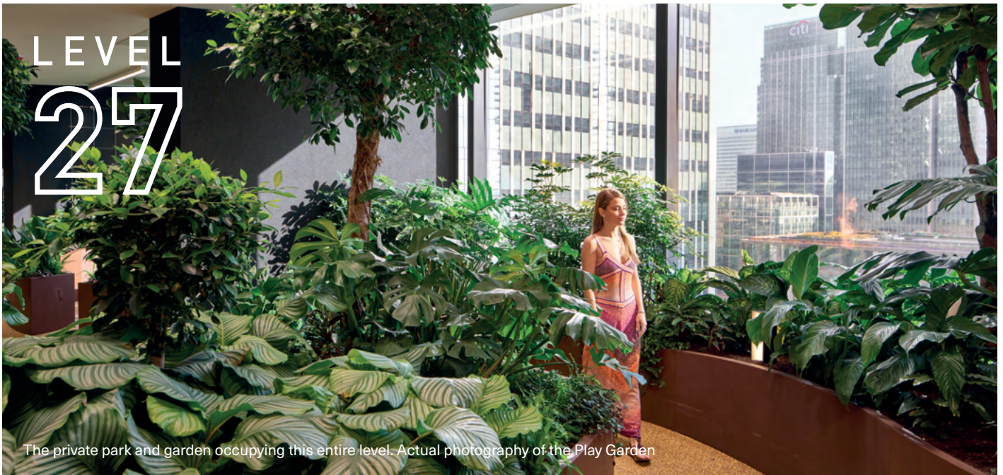
The private park and garden occupying this entire level. Actual photography of the Play Garden