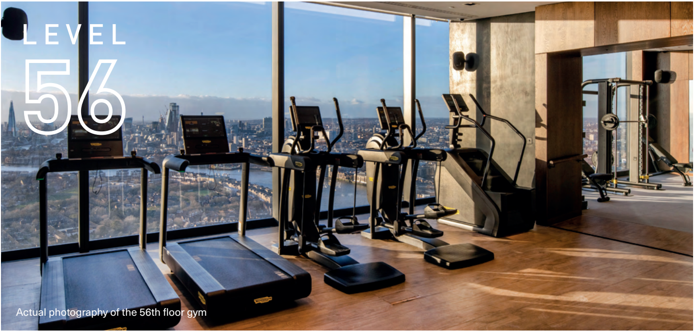
Actual photography of the 56th floor gym