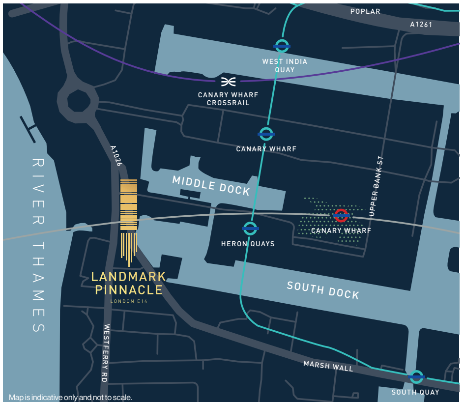
Map is indicative only and not to scale.