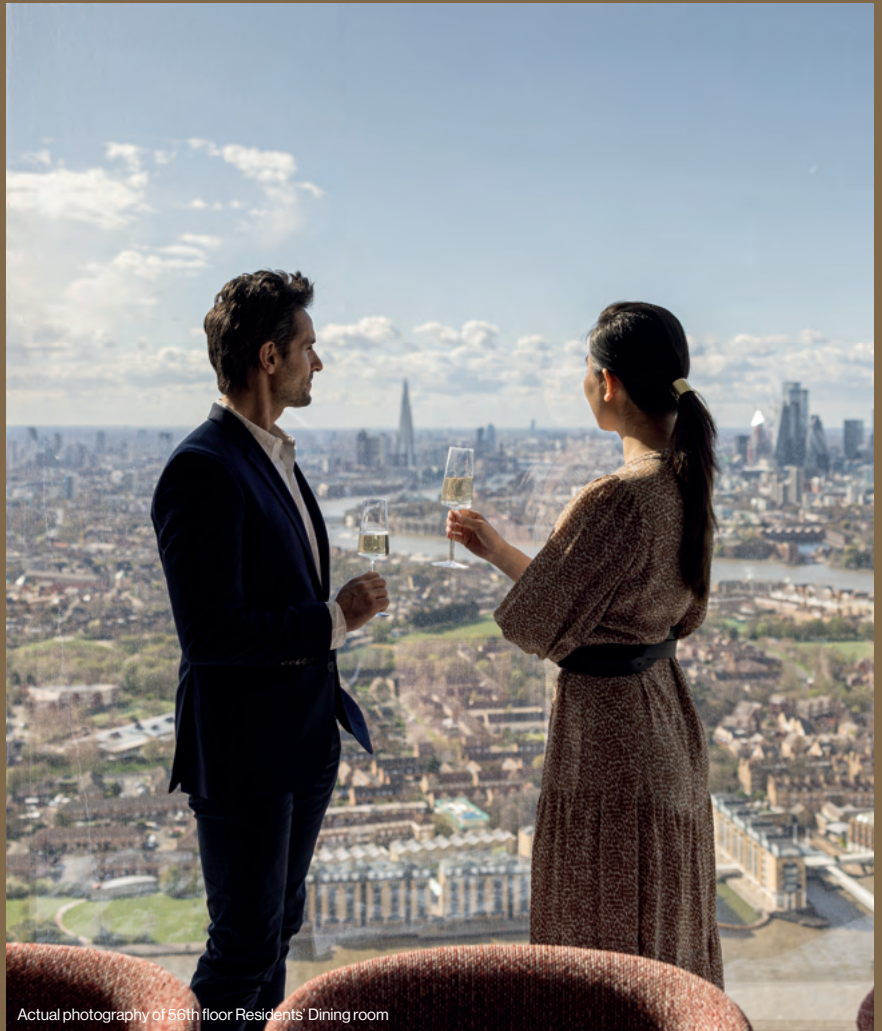
Actual photography of 56th floor Residents' Dining room

The Crossrail network brings an additional 1.5 million people within a one & a half hour commute of the central business districts of London.