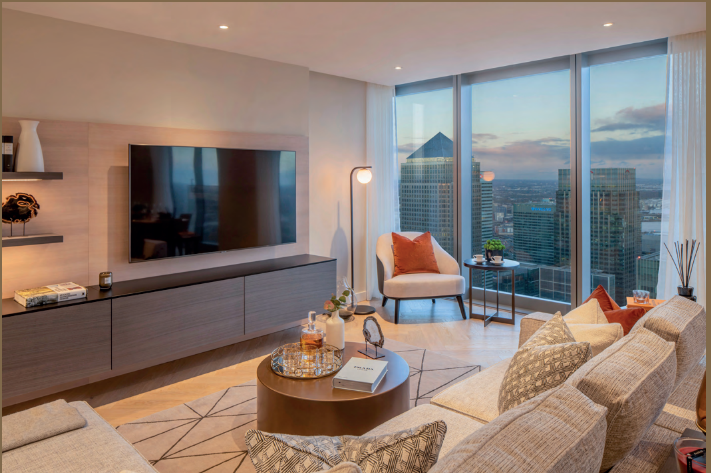
Photography of Show Home in Landmark Pinnacle.