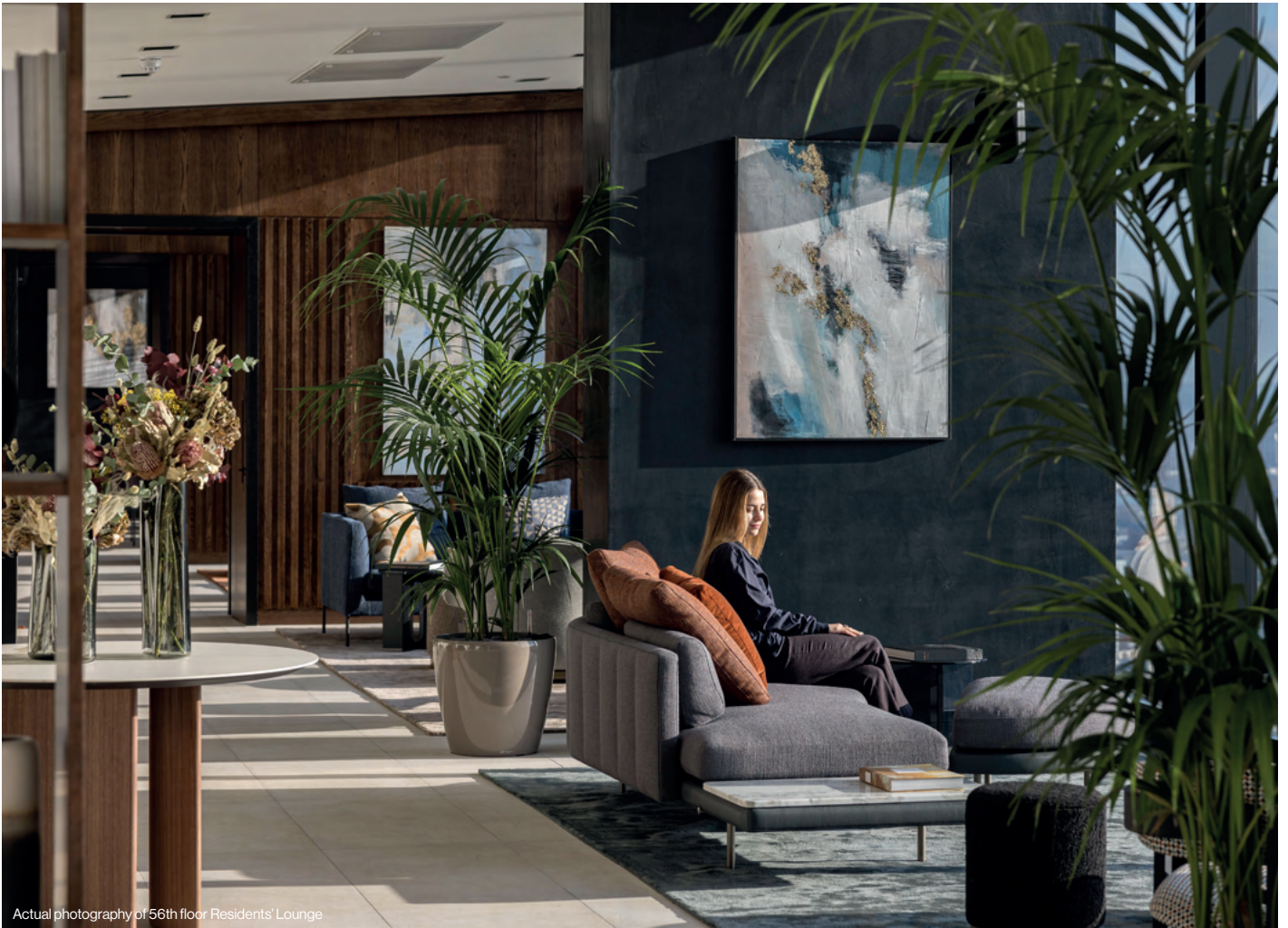
Actual photography of 56th floor Residents' Lounge